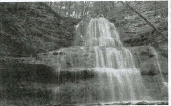
Many visitors to Hamilton are surprised to learn that the southern Ontario city west of Toronto is home to more than 100 waterfalls.

Thanks to Portage & Main, Canadians are familiar with the