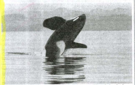
Visitors to British Columbia can often get a glimpse killer whales, for free, while aboard the BC Ferries service from Vancouver to Victoria.

network of parks and pathways that spans 17 km through the