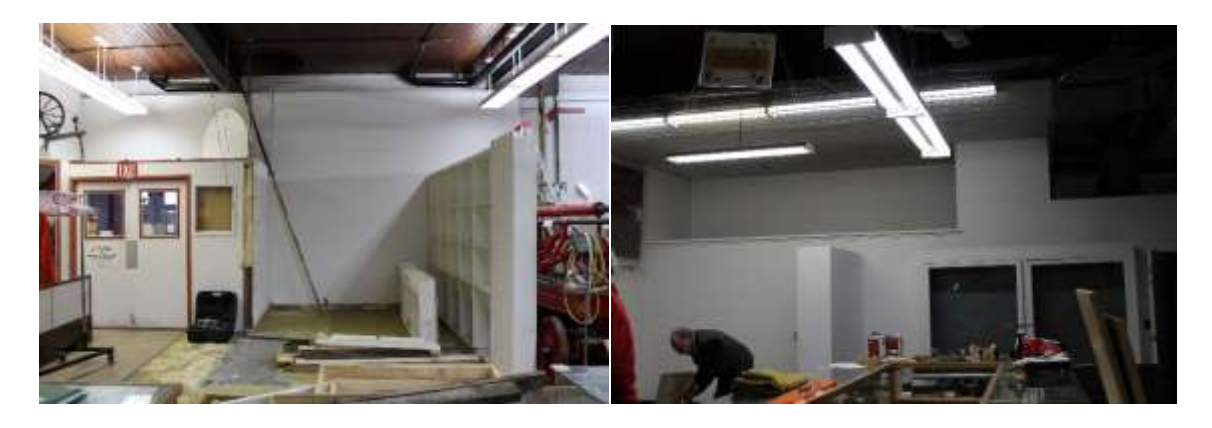
After demolition and re-painting January 2018.

The Historical Museum was finally brought into the new millennium with the installation of a debit terminal to accommodate debit and credit card purchases, and late in the year the front desk/souvenir shop area was getting overhauled- a renovation that is to be completed before May.