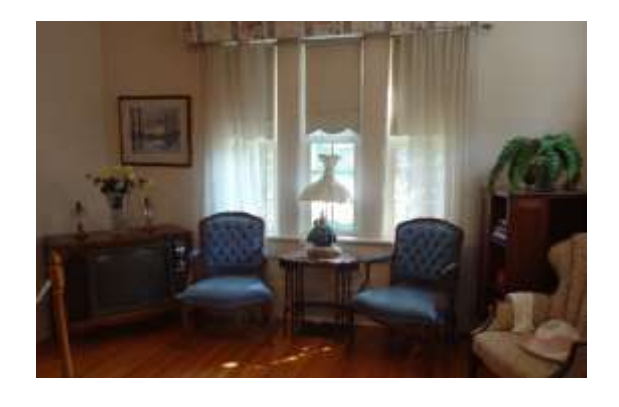
Diefenbaker House BEFORE